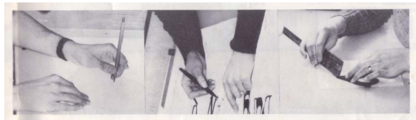
*Magnificat (not my design, partly cut by me) possibly the most difficult characters we ever hand-cut